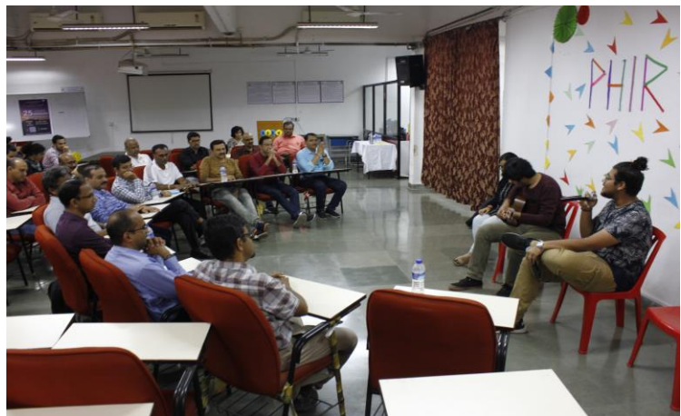
Alumni Cell, KJSCE